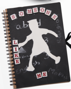
Highly Commended Winner 2021-2022, 4th & 5th class pupils, St. Oliver Plunkett N.S., Dublin